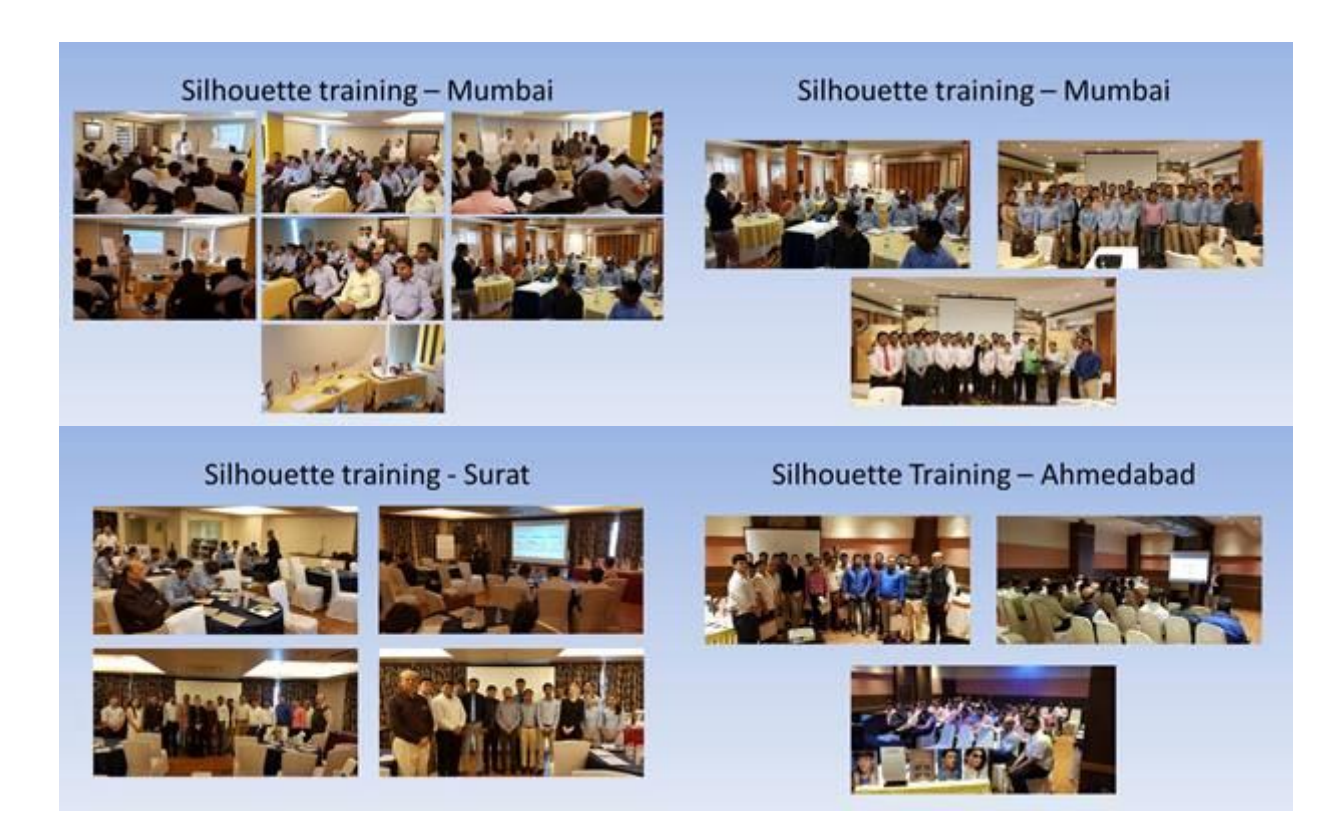
GLIMPSE OF SILHOUETTE BRAND TRAINING 2018.

Optimed Corporation had successfully organised a Silhouette Brand Training -2018 & we take the opportunity to thank all of our optic partners who had participated in our Silhouette brand training program 2018.