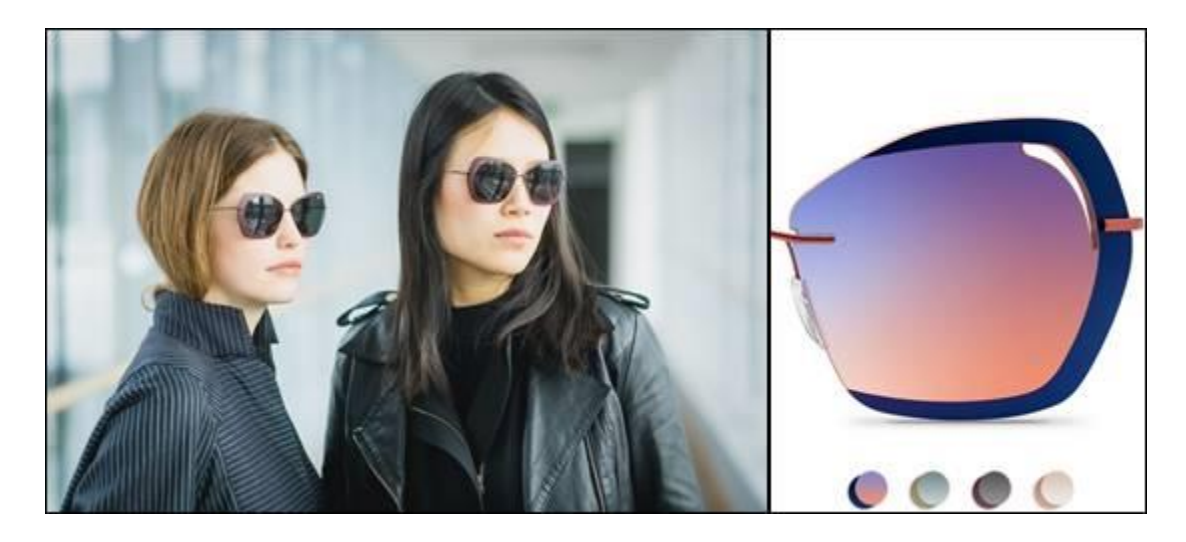
Special Edition: Perret Schaad for Silhouette

The new Special Edition bears the unmistakable signature of the two in-demand Berlin-based designers. Discover the extraordinary reinterpretation of the iconic Silhouette Titan Minimal Art.